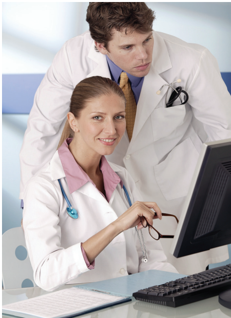
From Tablet PCs to servers, HealthDynamix has the Microsoft software that businesses and organizations depend on for success.

“Our software licensing specialists understand the complexities of the various Microsoft licensing programs. Our Select and Enterprise Agreement support teams maintain contact with you on a monthly basis throughout the life of your agreement.”