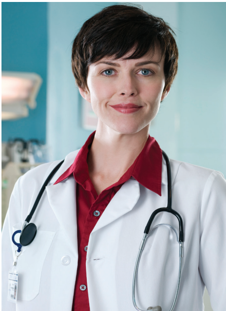
HealthDynamix has the Microsoft expertise you need for fast deployments or long-term migrations to new platforms.

“Our comprehensive knowledge and experience of Microsoft’s extensive offerings allow us to develop the ideal procurement, deployment and optimization of Microsoft Services for you.”