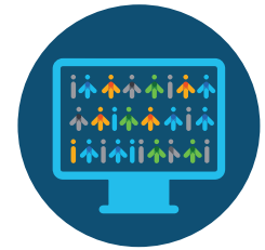
Consistent management across all sites