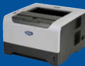
MICR Printing Solutions