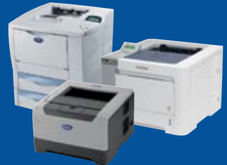
Shelf Edge Label Printer Solutions

Call your partner Account Manager at 1-800-555-MALL for more information.